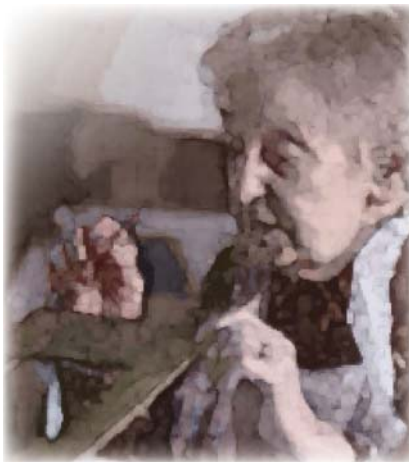
Arkansas Mature Worker Initiative

years, but the next two generations of replacement workers are each 15 percent smaller than the Baby Boom generation. And many of the newest worker entrants, ages 16 to 25, are not fully qualified to do the jobs that will be vacated by retirees.